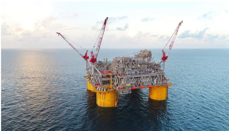
Shell Appomattox deep-water asset in the Gulf of Mexico

For decades, Bilfinger has been a leading provider of maintenance, modification, operations and inspection services to customers in the offshore oil and gas markets. Through integrated service offerings, innovative products and multi-skilled teams, the Group enhances the efficiency of assets throughout the full lifecycle, from construction to decommissioning.